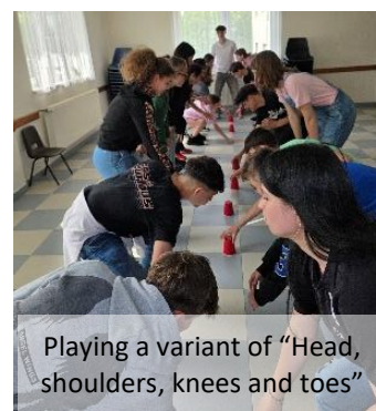
Playing a variant of “Head, shoulders, knees and toes”